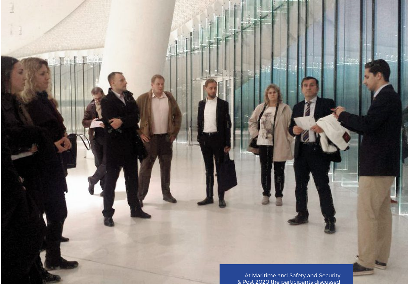
At Maritime and Safety and Security & Post 2020 the participants discussed the added value of maritime cooperation