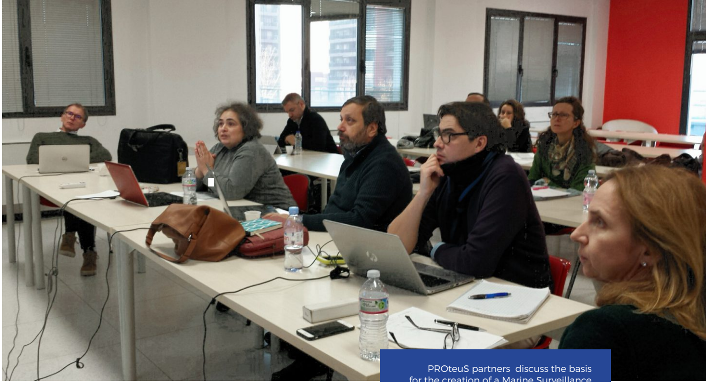
PROteuS partners discuss the basis for the creation of a Marine Surveillance cluster in the Mediterranean